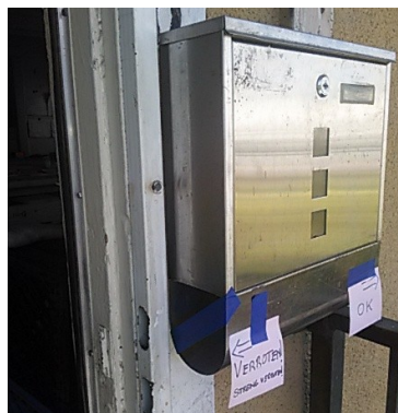
Figure 5: A gentle German-language reminder to the mailman, when he insists on putting rolled up newspapers through the opening my door can't open.

(3-30-24) Now that I finally have a way of accepting donations, I’ll begin making the process painless by exploring other options such as a PayPal button on my site. Expect continuing changes, including the ability to make anonymous donations.