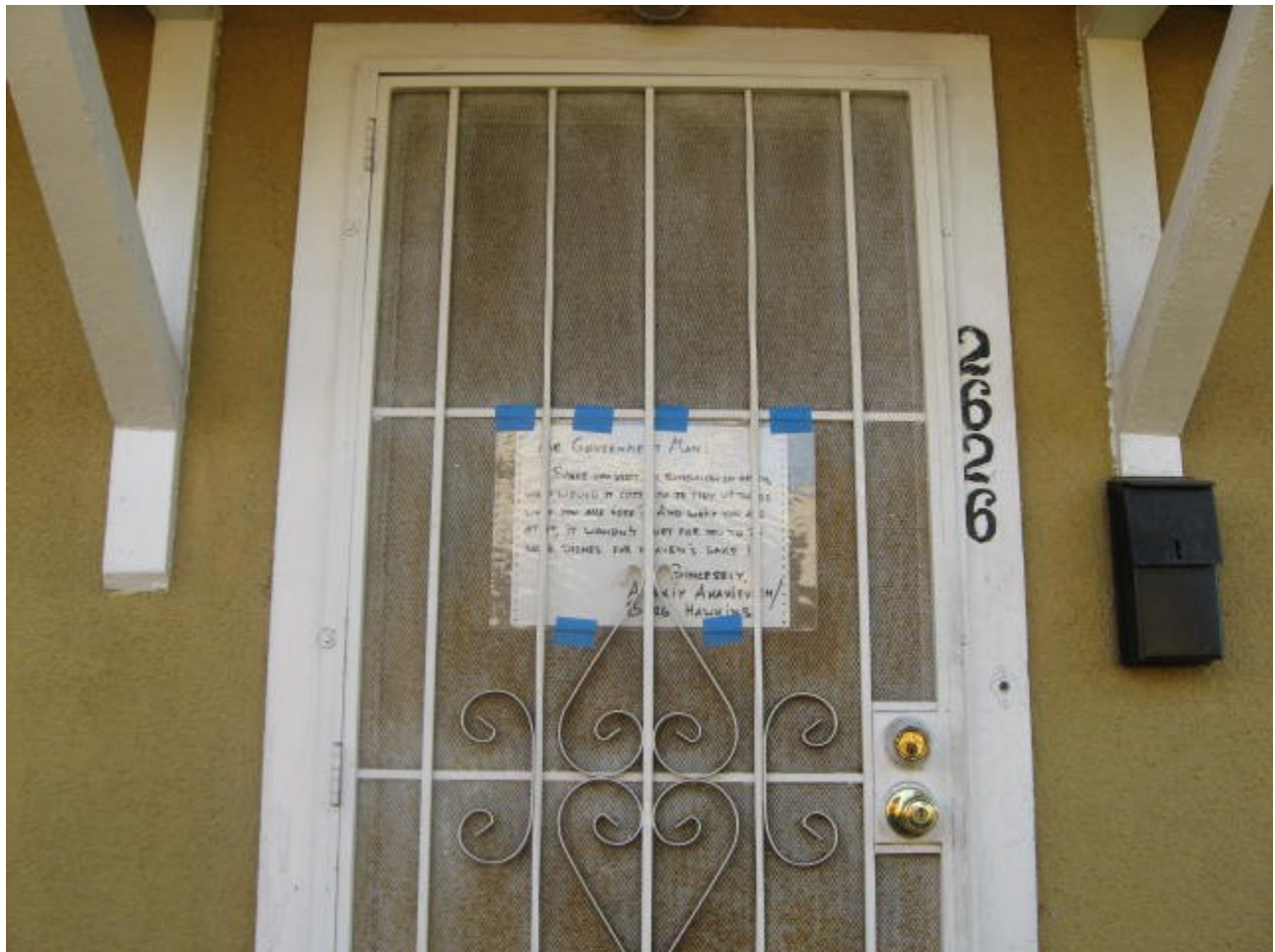
Front door of my bungalow: aka "Grand Central Station."

Acknowledge these emails if you have the time. Criticism and comments welcome. Please redistribute, attributing to me, including full text, name and address.